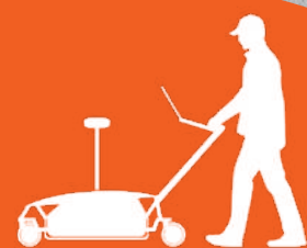
Hand pushed cart