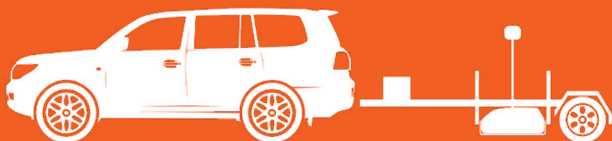
Rear mounted road trailer