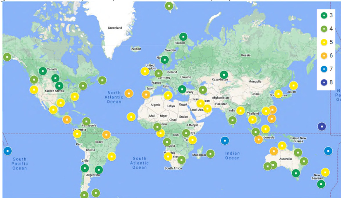
Figure 2: G4+ 95% height accuracy in centimetre. (Results may differ depending on receiver type.)

Measurements of 67GNSS receivers are used to calculate the position accuracy on a global scale with GPS, Galileo, BeiDou3 and GLONASS (G4+).